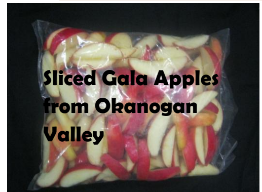
Sliced Gala Apples from Okanogan Valley

Schools around the state will be serving a locally-sourced meal and providing education and activities to celebrate the farms that feed us!!! It’s a day to celebrate and recognize all the nutritious local food in our area!