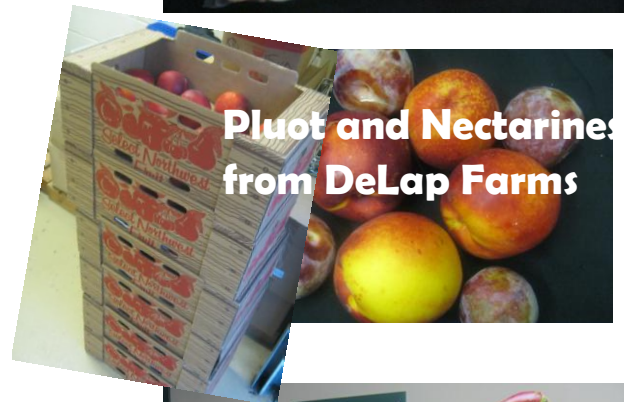
Pluot and Nectarines from DeLap Farms